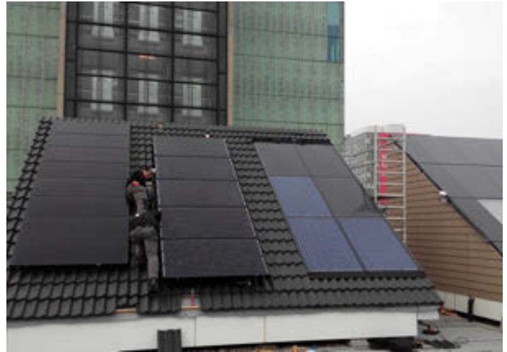
▲ BIPV project SolarBeat. Left PVT panels, middle PV panels and right 3 PVT panels and 3 solar thermal collectors.