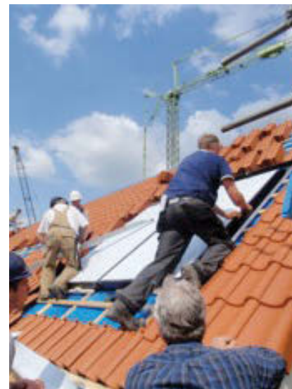
▲ Installing a typical Dutch roof integrated solar collector.