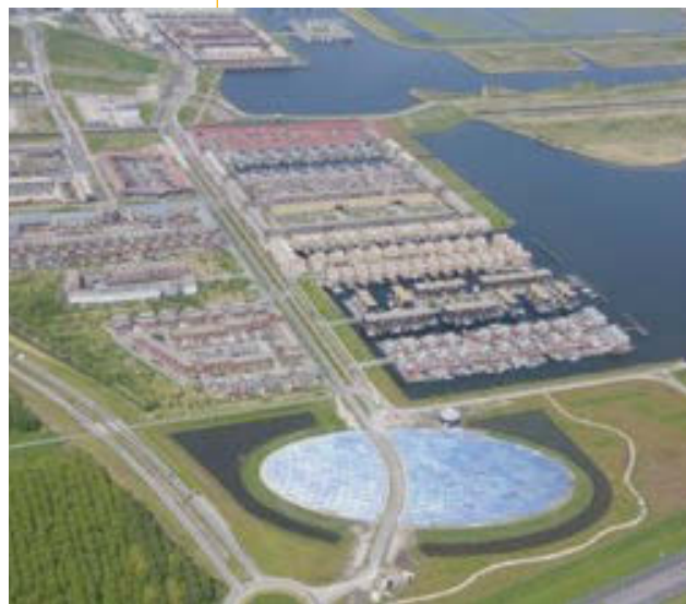
▲ Solar Island in Almere with 7,000 m 2 of solar collectors was the first solar district heating system in The Netherlands.