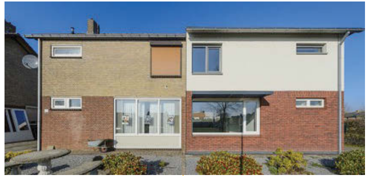
▲ A Net Zero refurbishment: before (left) and after (right).

To reach high solar fractions, it is necessary to store heat (or cold) efficiently for longer periods of time. "Seasonal heat storage is one of the most promising methods to do this," explains Camilo Rindt. During winter the sorption material is hydrated releasing heat and in summer the material is dehydrated by solar heat. Basically, this cycle can be repeated over and over again. The goal of this research is to gain more physical insight into the limiting transport properties of vapor and heat.