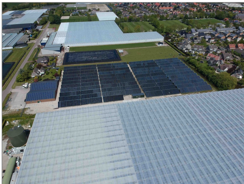
A 6.5 MW th collector field heats a greenhouse in Heerhugowaard, the Netherlands, since 2019.

Two new applications in this sector worth highlighting are solar heated greenhouses , which include systems ranging from 126 m 2 collector area to just over 14,000 m 2 , and solar heated gas pressure control systems , which use solar to heat natural gas at gas pressure regulation stations during pipeline transportation, an interesting niche application being used in several systems in Germany.