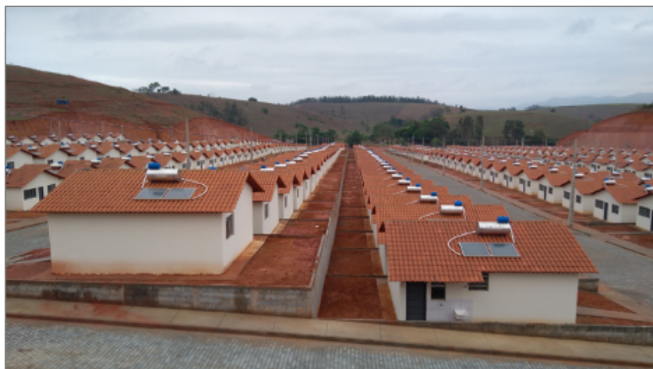
Around 400,000 thermosiphon systems were built in Brazil as part of the Minha Casa, Minha Vida social housing programmes.

Systems that provide hot water and heating in residential and public buildings, as well as hotels and hospitals and public buildings, represent around 60% of the newly added systems . A key point to note is that significant market growth occurred mostly only in those countries with market sales dominated by small-scale systems (in particular thermosiphon systems). The report shows that national social housing programmes linked with the installation of solar water heating systems have a very positive impact on market development.